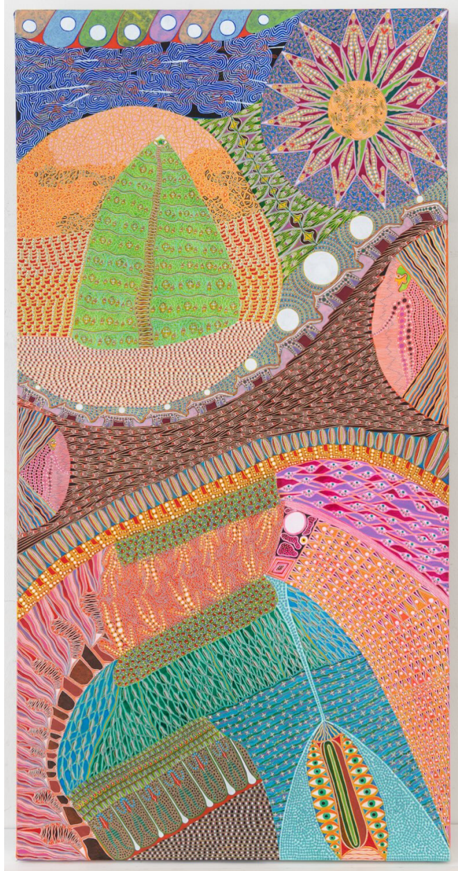
That Honest Eye That Sees / It Is / That Heart In Love That / Feel / Breathing Winds Of Forces / Into Caves Heads / Stars / Chosen Chances / They Are / Guiding Flames / Then Hands On Another Creation, Acrylic, inks, flashe on canvas, 2023, artwork by Domenico Zindato

By aligning essay, interview, and plates, the publication makes clear why Zindato's recent paintings matter: they bring decades of accumulated imagery and technique into a more expansive pictorial register. The result is a book that presents painting, in Zindato's hands, as both a material process and a means of mapping the interwoven relations that shape lived and imagined worlds.