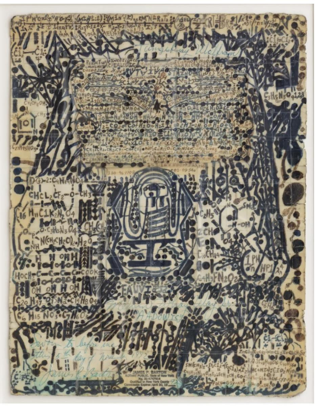
Melvin Way (1954 – 2024) Fauvi, c. 1989 Ballpoint pen and Scotch tape on paper 10.75 x 8.5 inches.

surrender his works, he often made Xerox copies of them which inspired a new approach—Way then added blue and/or black ink to the copies. These xerographies comprise a small but significant portion of his oeuvre.