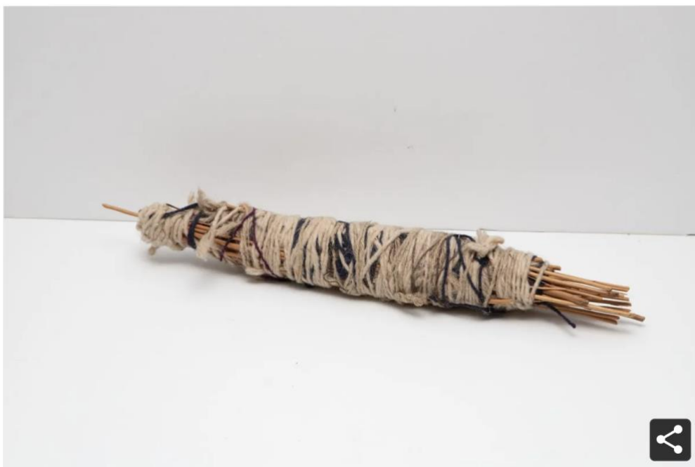
Judith Scott, Untitled , n.d.