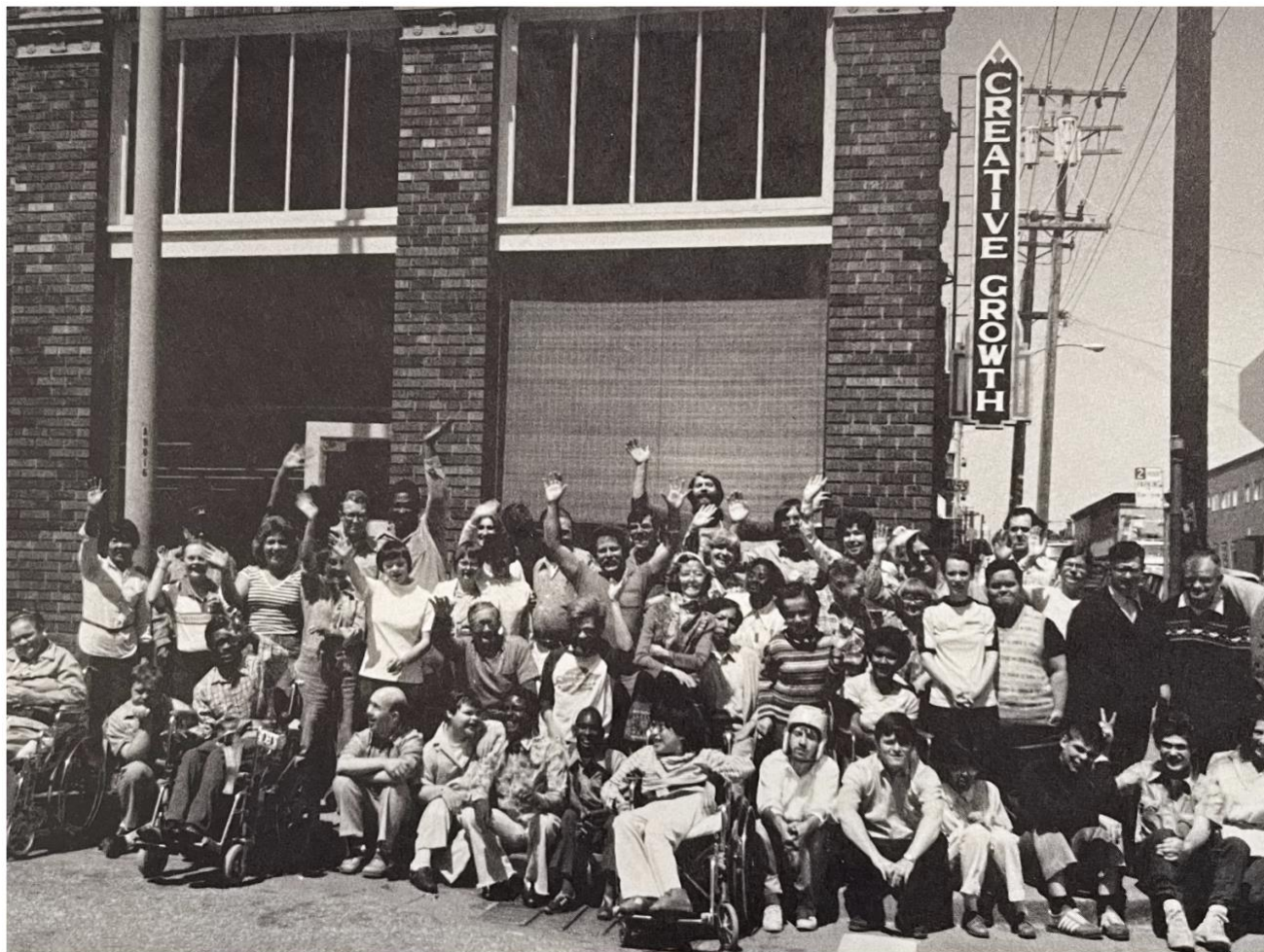
Members of Creative Growth Art Center in Oakland, California, 1983.