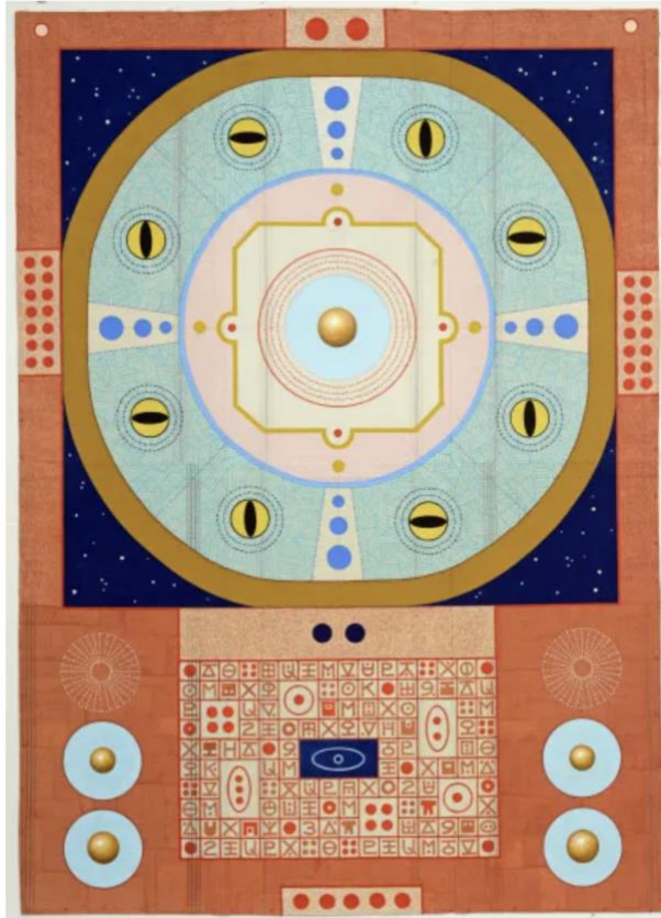
Karla Knight (b. 1958) Universal Remote 1 , 2022 Flashe, acrylic marker, pencil, and embroidery on cotton 68 x 49 inches.