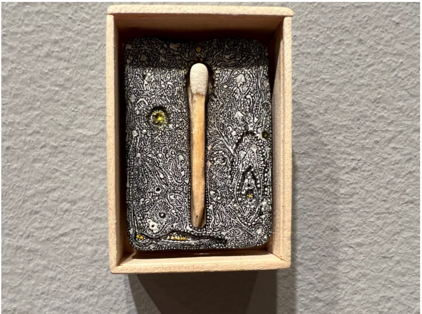
Terence Koh, at Andrew Edlin.

In one framed dimensional work, for instance, a tiny vertical rectangular piece with rounded edges covered with intricate white patterns and some carvings, resembles an archeological artifact with mysterious sacred text or perhaps a cave painting. In the middle, a match with a white head resting vertically within a carved mold, like a grave or a cradle. The match, as a source of fire, carries a strong sense of a dual presence and immediacy—life and destruction, light and dark, fire and ashes. I was informed that the artist, who is almost blind, made many of these drawings by burning. They indeed invoke different stages of burning, alternating between incinerating, kindling, or going up in smoke on the verge of disappearing.