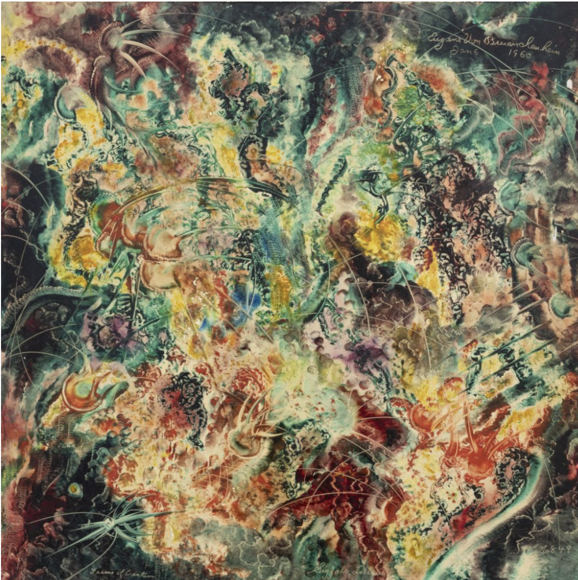
Eugene Von Bruenchenhein, No. 849, Jan 6, 1960 (1960). Collection of KAWS.