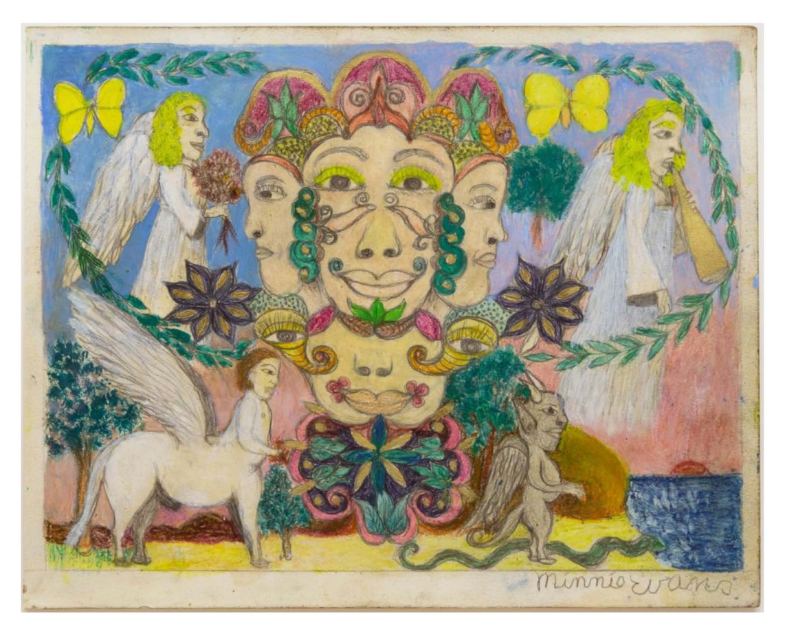
Minnie Evans, untitled, no date.

When the crew of five that organizes the Outsider Art Fair (OAF) wrapped the eighth Paris edition on October 30, they found themselves with just three months to organize the New York iteration of the event.