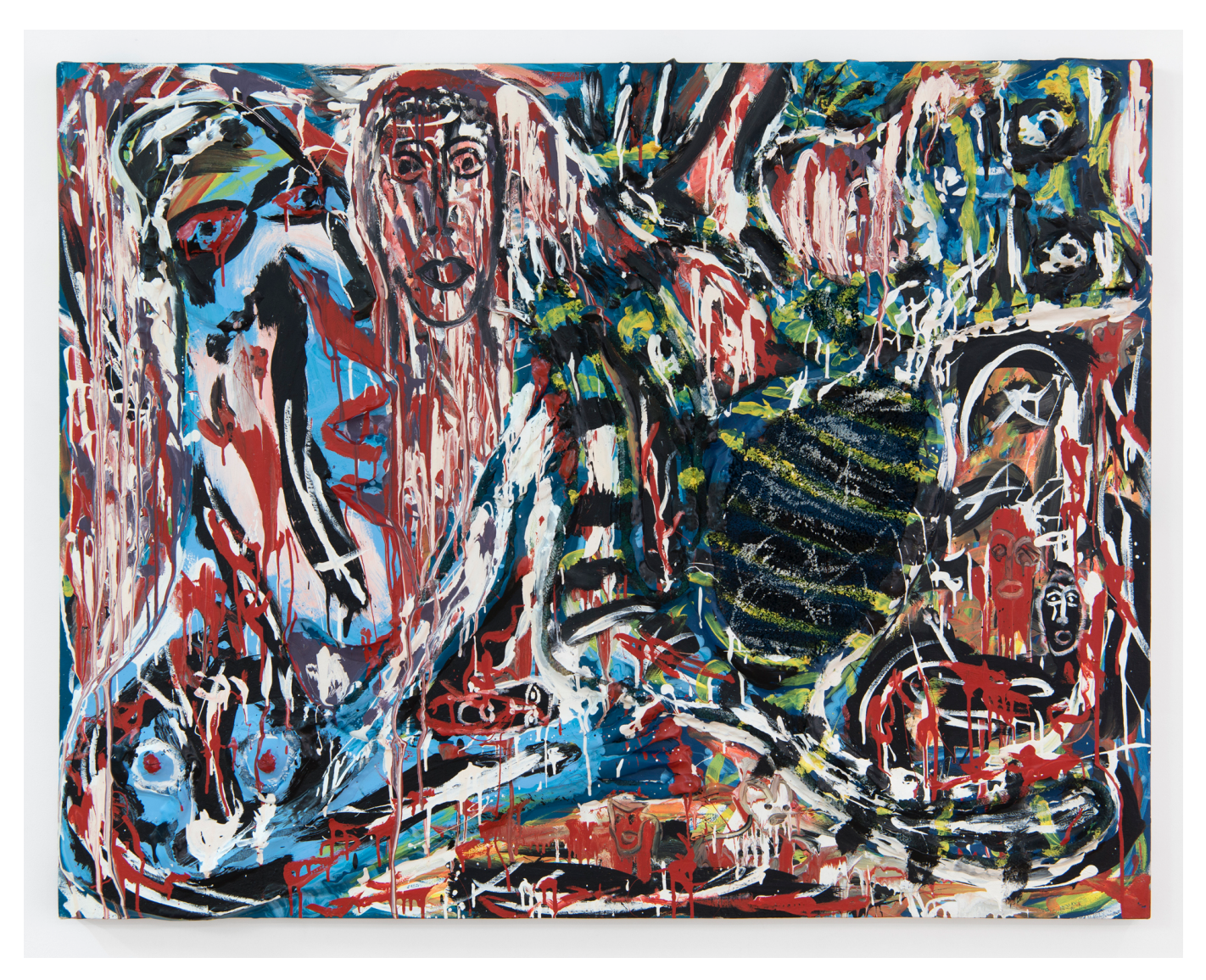
Thornton Dial,"Shedding the Blood," 1991, Mixed Media, 48 x 60

"When you have that kind of passion and necessity to make, it shows," Ogden says.