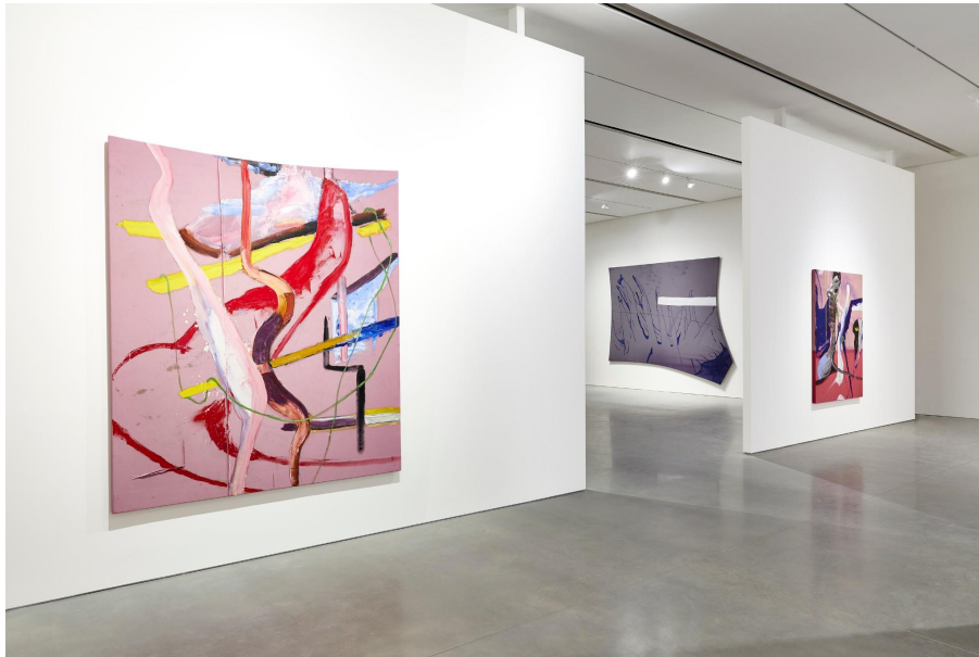
Installation view of Julian Schnabel: The Patch of Blue the Prisoner Calls the Sky at Pace Gallery.

Artists have been working with found objects since the beginnings of modernism, but the meaning implied by the objects that they use and the way that they employ them is always changing. Change, in fact, is one of the main reasons for working with reclaimed materials. Art can change the world—at least from what it was to what it can become.