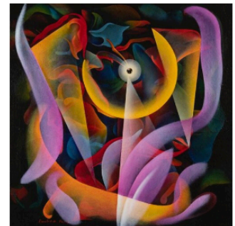
Paulina Peavy, Untitled