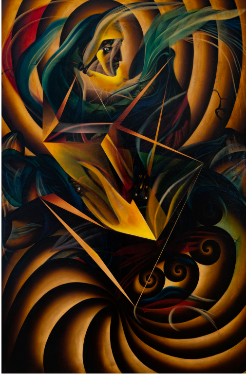
Untitled , 1940s – 1950s, c.1980, Oil on board, 72 x 48 inches Courtesy of the artist and Andrew Edlin Gallery, New York (Photo by Adam Reich)

Her large Untitled paintings with faces and geometric shapes coming out of ribbons and streams of color, seem at once out of place and in perfect harmony. The brushstroke and style changing throughout a piece, style of a brushstroke, the layering of an image on another...it is because of this that also make dating her works, especially her paintings, is an impossible task.