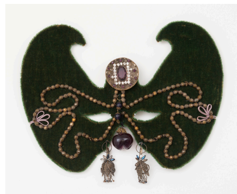
Installation view of Paulina Peavy/Lacamo: They Call us Unidentified , Andrew Edlin Gallery, New York (September 6 - October 19, 2019). Green Black Cat , n.d. Mixed media, 10 x 12.50 x 0.50 inches