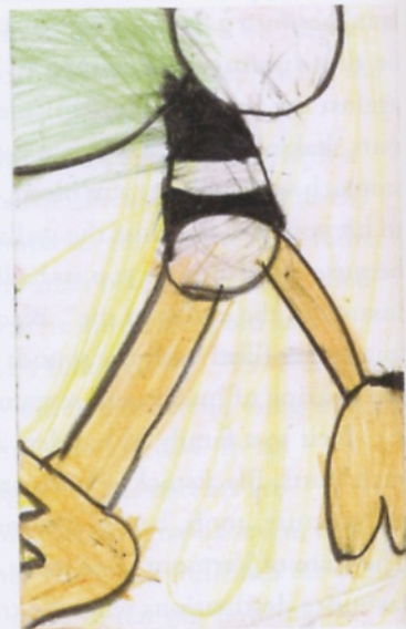
left: Untitled , c. 1960, crayon on paper, 13.5 x 8.25 ins., 34 x 21 cm