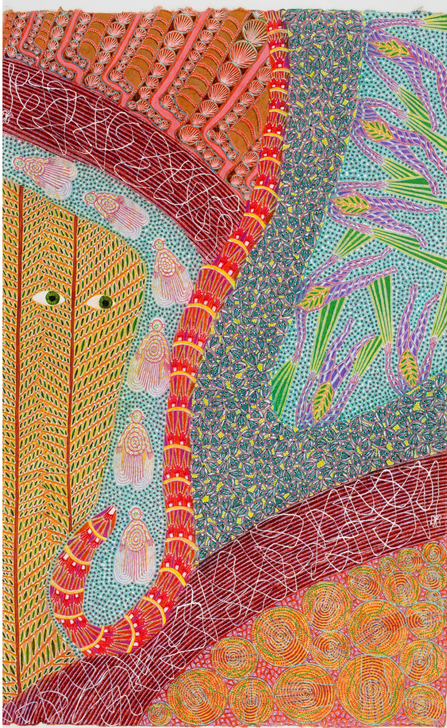
DE LOS RIOS A LOS DIOSSES, 2014, INK AND PASTEL ON PAPER, 16" X 10".