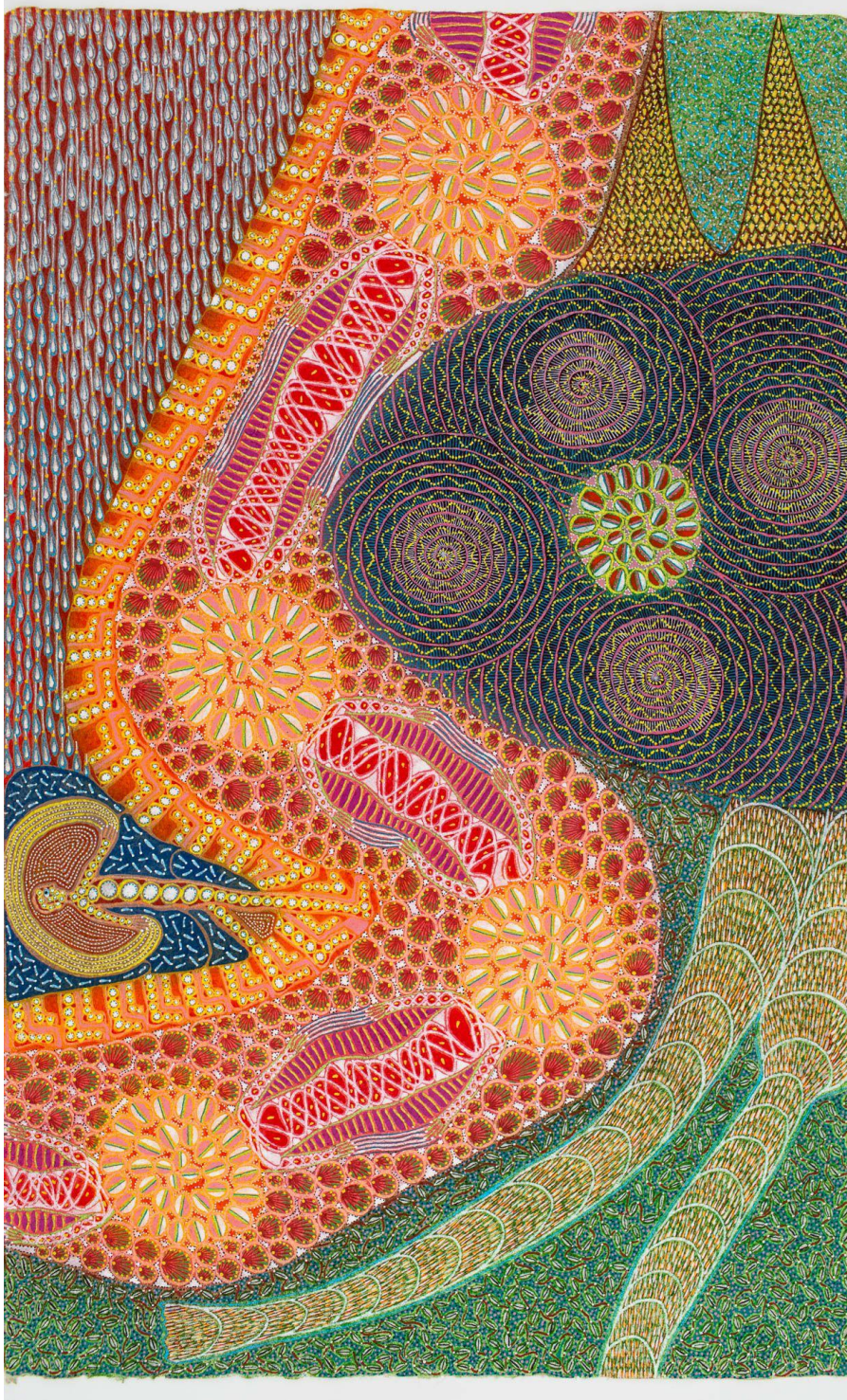
A BREATHING BUNDLE, 2014, INK AND PASTEL ON PAPER, 16" X 10".