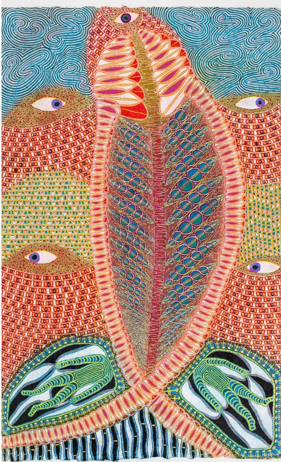
I DO NOT ASK HOW IT CAME ABOUT THIS CREATION, 2015, INK AND PASTEL ON PAPER, 16" X 10".