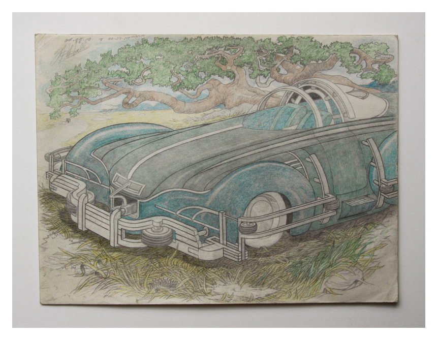
William Hall, "Untitled" (2010), pencil crayon, 9 x 12 in

street, I couldn't make sculpture anymore. In the streets, you have a whole different mindset."