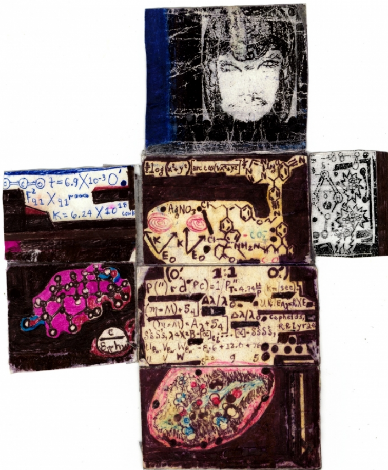
Melvin Way, "AgN03" (2015), ballpoint pen on paper, with Scotch tape, 8.5 x 7 inches