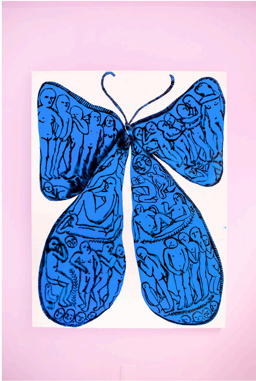
Emma Kohlmann, Blue Butterfly , 2018