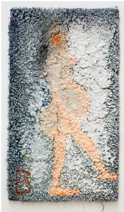
Brook Hsu, Pregnant , 2018