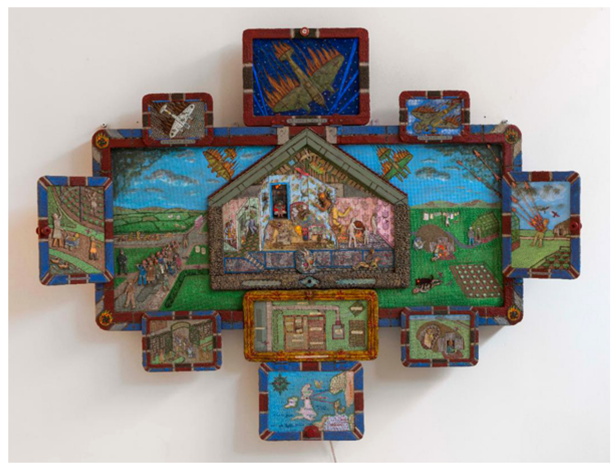
Inside–Outside. 2016. Mixed media, 61 x 46 x 4 inches.

I knew when I chose to be a sculptor that I was picking the most physical of the visual arts. I knew I wanted to do something physical with my body, and I also knew I wanted to do something with my mind. I love to think about things and create things in my head. Sculpture seemed to be the perfect fit for me. I felt fortunate that I was able to pick something that I knew I loved—and that I would sustain that love.