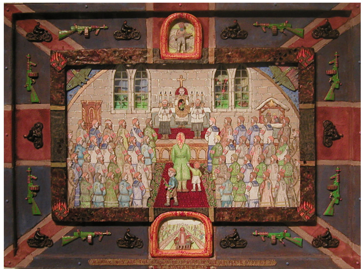
Mummy, Why Are the German Prisoners of War at Mass with Us? 2004. Mixed media, 36 x 27\frac{1}{2} x 3\frac{1}{2} inches.

I went to Scotland to see him when I was 40. He was a pretty nasty, violent alcoholic. And he had been very mean to my mother. He did some horrible things to her. Every day I woke up in this country wanting to kill him. At the age of 40, I thought, this is haunting me. I've got to go back and look him up and prove to myself that I wouldn't kill him. And that's exactly what I did. It was a very moving experience for both of us. I continued to write to him until he died a few years later. He was working as a guard in the prison down the road from where we lived, which during the war had been a prisoner-of-war camp for the German Luftwaffe.