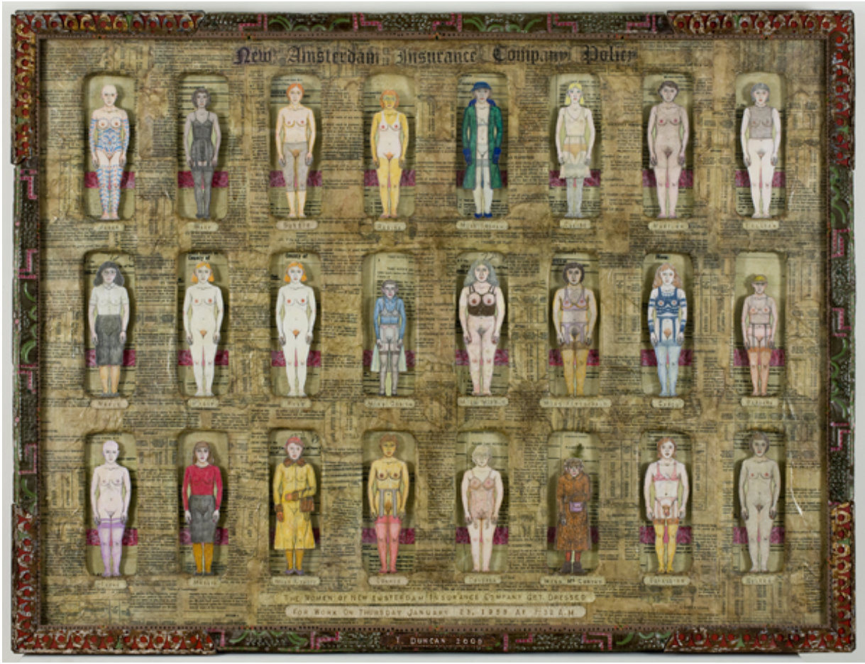
The Women of New Amsterdam Insurance Company Get Dressed for Work. 2009. Mixed media, 52 x 39½ x 2¾ inches.

camaraderie, but it was mindless work. I knew that an office wasn't for me. I figured I'd probably like to do something with my hands. My aunt knew someone who knew someone, and I worked for a man after school. He did mechanical displays. I'd go out to Brooklyn and buy electric motors for him. He had a great office on 42<sup>nd</sup> Street in a penthouse. This was back in the 1950s.