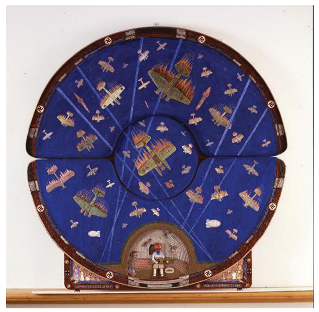
Tommy and the Scottish Sky. 2007. Mixed media, 47½ inches in diameter, 1½ inches deep.

physically make them, whether it's a sculpture or a wall hanging or a relief. [ He holds up a pad. ] This is sketch pad number 91. I write down every idea that I get. Sometimes I wake up in the middle of the night, and I'll have solved a problem. I'll get up and write it down. I just did a study for a piece I was thinking of doing, a burning tank series.