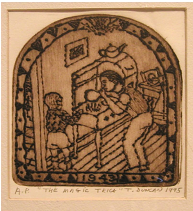
The Magic Trick. 1995. Hand-colored engraving, 4<sup>3</sup>/<sub>4</sub> x 5<sup>1</sup>/<sub>2</sub> inches.

with a mast that could fold down; the sail would go down these little rings. I can still feel the texture of the hull of the boat. It was magic to see him make these things, and they were for me. He could take the handle of a baby carriage and turn it into the runner for a sled and make the sled out of wood. He would do all kinds of wonderful things. He was like a magician. One day he took a light bulb and said, Watch me. He cut off the filament of the light bulb, removed the filament, held the bulb over the kitchen stove and just gently blew up the light bulb.