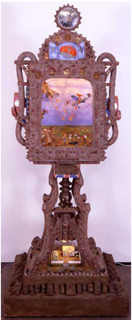
The Brandy Strafing. 1991. Mixed media, 28 x 28 x 73 inches.

out in the brandy by a German plane when I was 2 years old. The brandy was a cow pasture that doubled as a playground. My mother heard the siren and came running to get me. I don't remember the event of the strafing. I know unconsciously I must have seen the bombers. Whether I saw them in Edinburgh or in Shotts, it doesn't matter. For me it's an iconic image that reappears in my work.