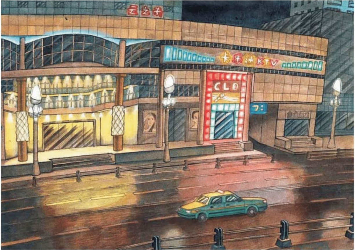
Newliu's comics. Courtesy of the artist.

Organized by Noguchi Museum director Brett Littman with Zhou Yi, partner and curator at the C5 Art Center in Beijing, "Good Kids" is a focused presentation of works by 10 Chinese artists whose anti-conformist attitudes make their drawings and comics impossible to distribute at scale; to see their work, you'll have to find it online or seek it out in their studios.