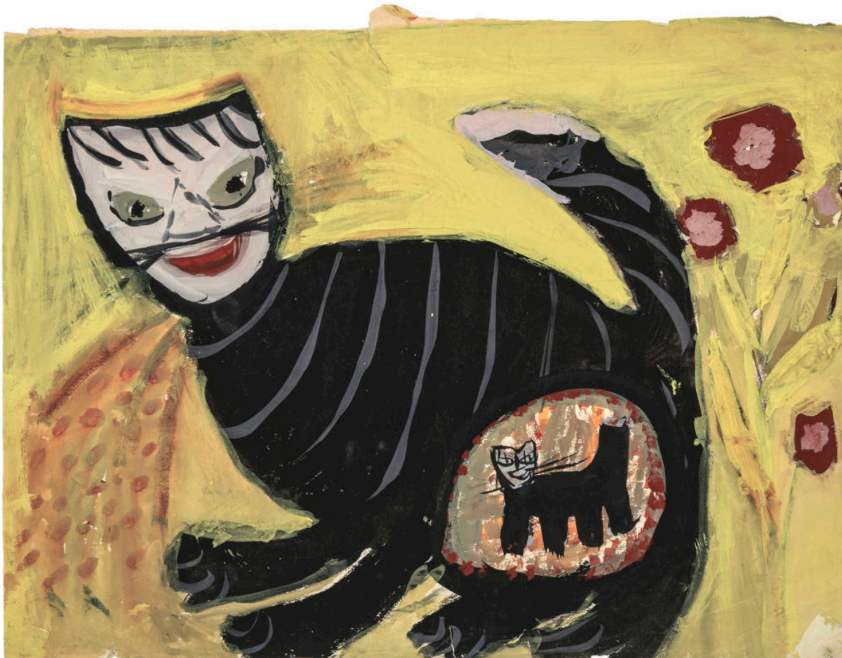
The Friern Hospital Collection. Courtesy of Shrine.

Even before French artist Jean Dubuffet coined the term “art brut” in the 1940s, a group of patients at Friern Hospital, on the outskirts of London, were creating strange and compelling drawings and paintings that are on view here for the first time in the US. Prices range from $2,000 to $7,000; by the end of the preview, a handful had sold but numerous sheets remained available.