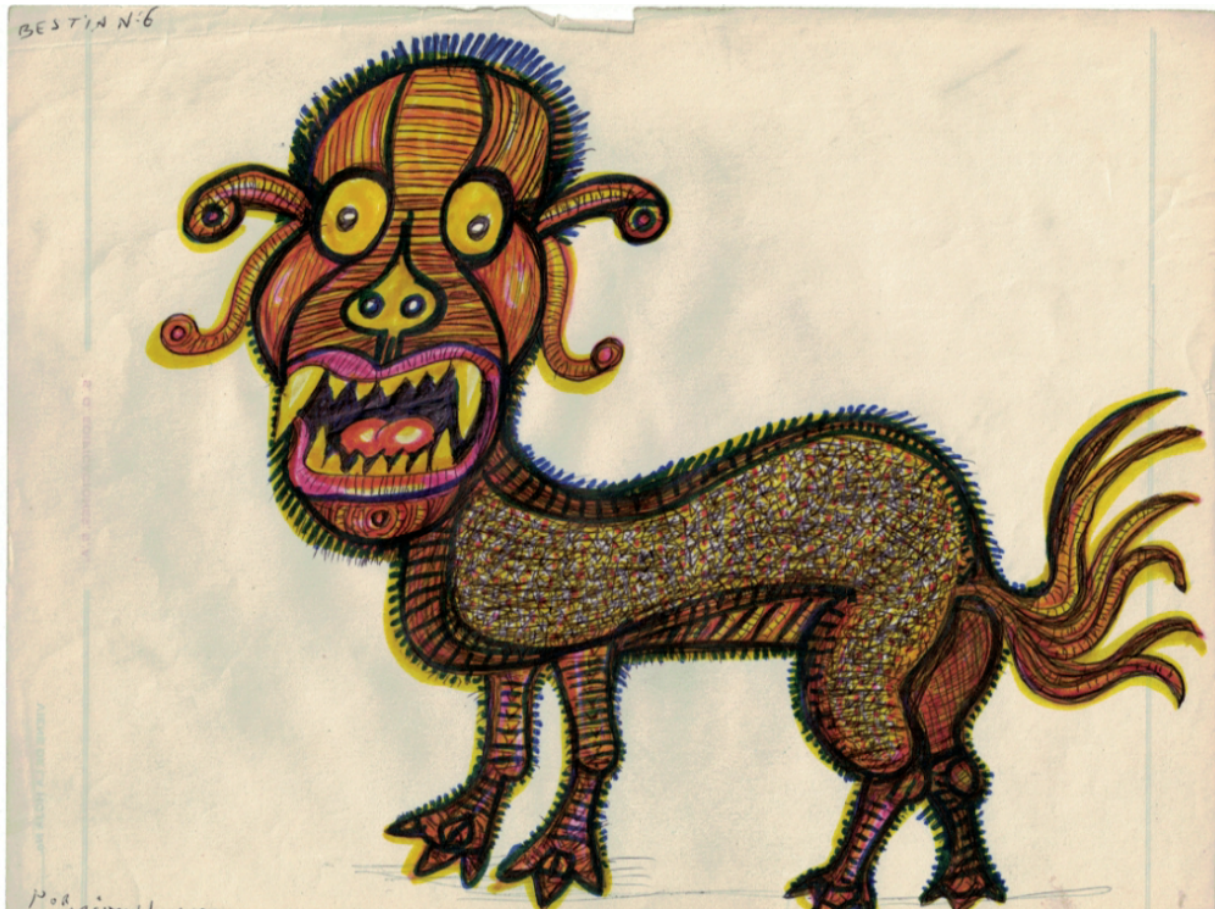
Mario Mendoza, Untitled .

Some of his ballpoint and felt-tip pen drawings from the 1930s and '40s feature caricatures of figures like Hitler and Stalin, but the drawings on view at the Julie Saul Gallery booth, priced at $1,200, depict different kinds of monsters: hairy, four-legged, bug-eye, sharp-toothed beasts.