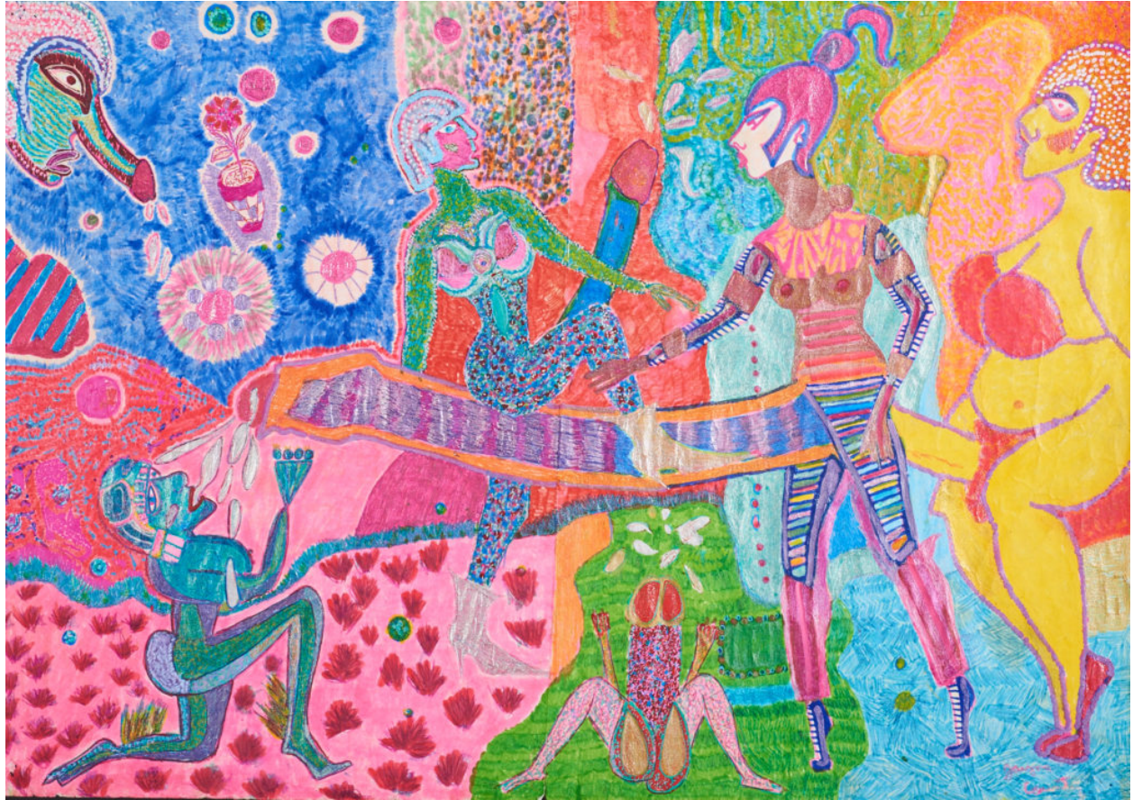
Jayne County, Attack of the Sodomites (1982–2007).

$8,000. Good news for collectors: a score of them remained available at the end of the preview.