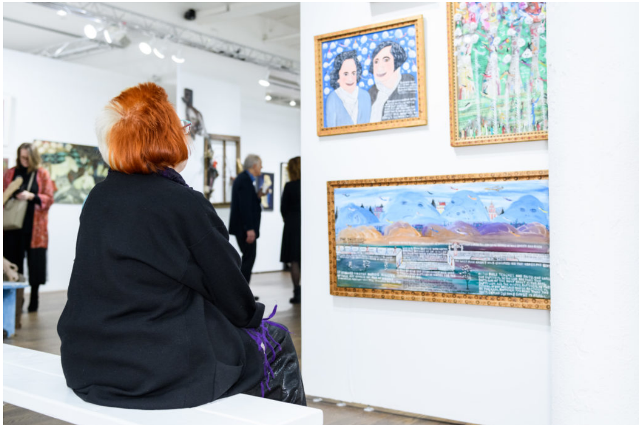
Opening Preview for the Outsider Art Fair, 2019.

There were smiles everywhere in the preview hours of the 27th edition of the Outsider Art Fair in New York, open now through Sunday at the Metropolitan Pavilion. This year, the show includes more than 65 international exhibitors presenting works by artists who have taken non-traditional paths to art-making, far away from the floodlights of glitz and cash often associated with the art market.